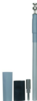
Figure without obligation