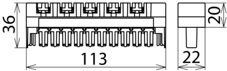
Dimension drawing BM 10 DRL

Plug-in SPD block (without SPDs) for 1 to max. 10 three-pole GDT 230 B3 ... gas discharge tubes. Also suitable for DRL protective plugs with earthing frame.