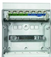
Integrated plug-in terminal technology for PE and N conductors.